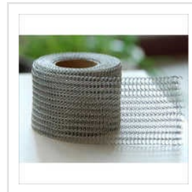
Steel Wire Net Tape