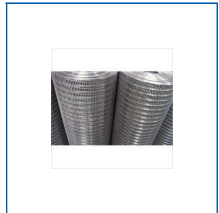
MS WELDED WIRE MESH