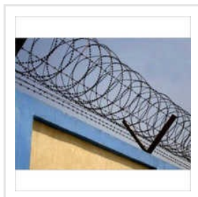
Concertina Coil Fencing