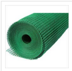
PVC Coated Welded Mesh