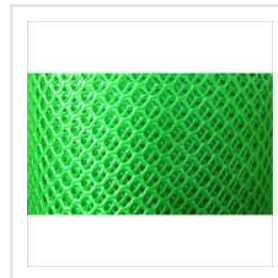
Plastic Welded Mesh