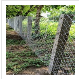
Outdoor Chain Link Fencing