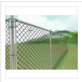
Playground Chain Link Fencing