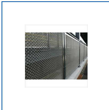
ELECTRIC WIRE MESH