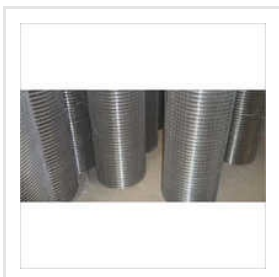
SS Welded Wire Mesh