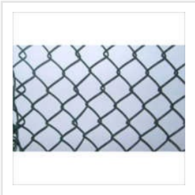
PVC Coated Chain Link Fencing