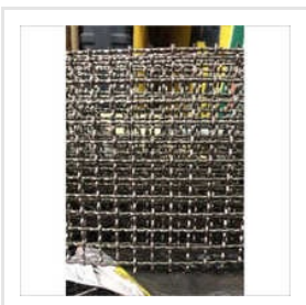
MS Crimped Wire Mesh