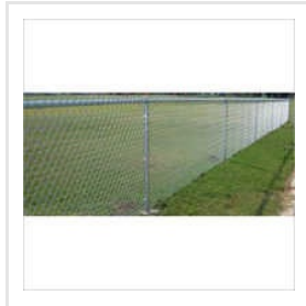
GI Chain Link Fencing