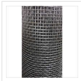
MS Wire Mesh