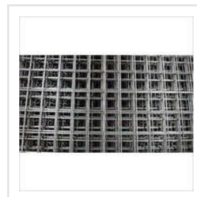
Welded Wire Mesh