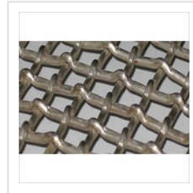
SS Crimped Wire Mesh