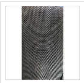
SS Wire Mesh