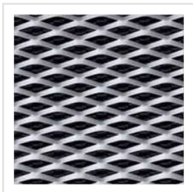
Aluminium Expanded Wire Mesh